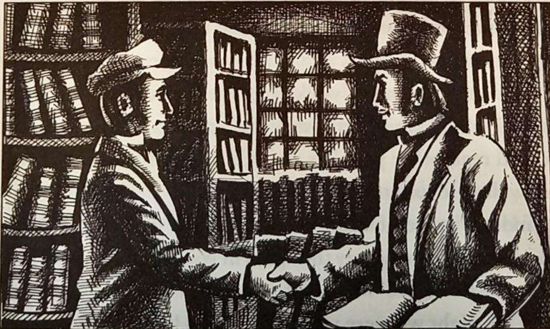
My first meeting with Auguste Dupin

Our first meeting was in a small bookshop in the Rue